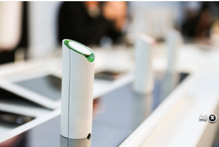
Experience smells virtually

About as far from the shops as can be, the OPHONE is part of a larger experiment known as the Olfactive Project. With Edwards teaming up with master perfumer Oliver Perscheux and coffee nut Ryan Spinoglio, their aim is, in my opinion, far from simple. The product, or at least the latest version, comes in the form of a cylinder which sits on top of a base filled with chemicals. Bearing certain similarities to a smart phone, the OPHONE receives coded messages which tell it just what smells to produce.